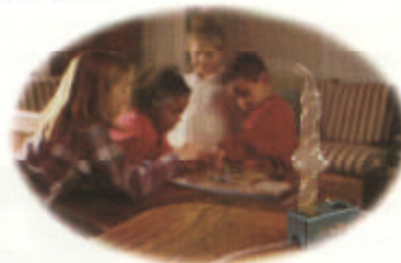
Diffuse Purification, Peace and Calming, Peppermint, Lemon, Joy or Purification to benefit the whole family.

Diffusing is convenient and highly effective. A diffuser includes an oil well, a nebulizer (glass tube) and an air pump to fill a room with a micro-fine mist of our wonderful aromas.