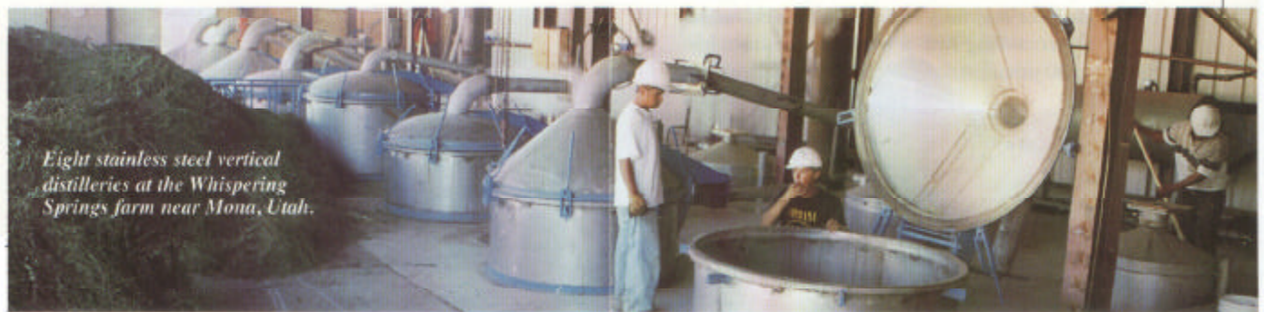
Eight stainless steel vertical distilleries at the Whispering Springs farm near Mona, Utah.

The Essential 7 Kit contains 5 ml. bottles of these seven exquisite oils plus a free instruction tape.